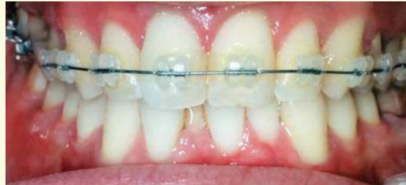
Tooth coloured brace

Fixed braces are available in tooth coloured varieties that blend in with the natural colour of teeth. The wires used to straighten teeth can also be coated with a tooth coloured material to make them less visible. Some tooth coloured braces are not placed on the bottom teeth as they can cause wear to the top teeth.