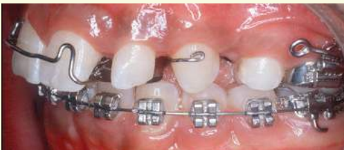
A removable brace on the top teeth and a fixed brace on the bottom teeth

Your speech will be different at first. Practice speaking with the brace in place e.g. read out aloud at home on your own. In this way, your speech will return to normal within a couple of days. To begin with you may produce more saliva and have to swallow more than normal. This is quite normal and will quickly pass.