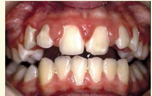
Damage caused by the brace due to sugary snacks/drinks and poor brushing

Sugary snacks/drinks and poor cleaning of your teeth and brace will lead to permanent damage to your teeth as shown in the picture below.